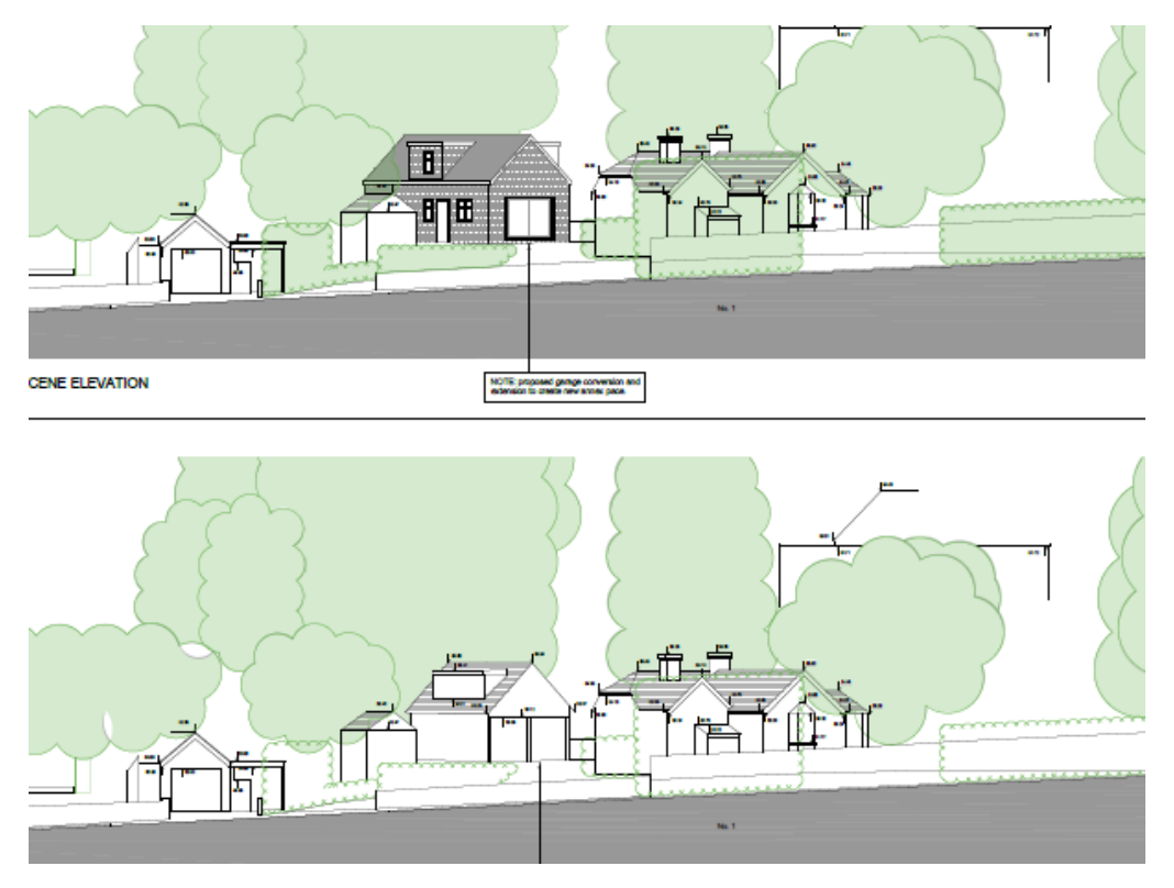
Figure 2: Existing and Proposed Street Scene

7.5 The proposed built from of the garage would not be disimilar to the existing garage in terms of its width and height. The annexe would respect the ridge height of the host dwelling and retains the gable frontage as the existing.